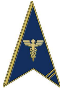
2 Bars to the Gold Award