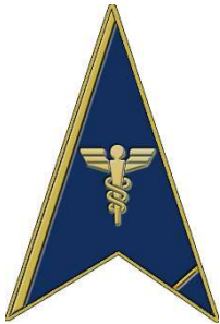
Bar to the Gold Award