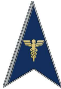
Starfleet Medical Silver Award