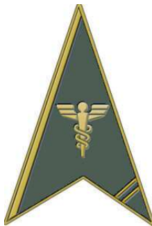
2 Bars to the Gold Award