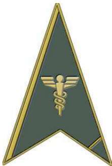
Bar to the Gold Award