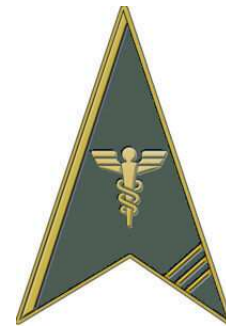
3 Bars to the Gold Award